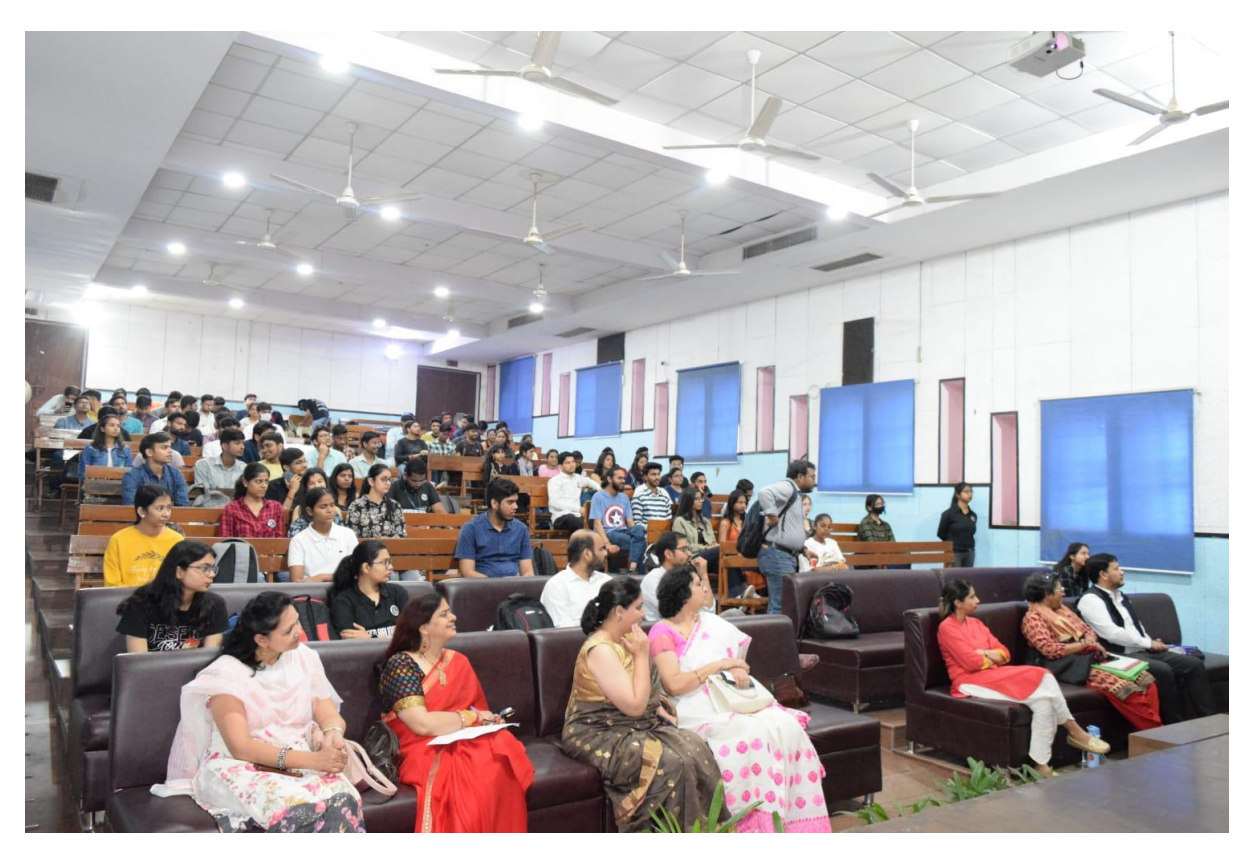
The Guftugu session

<u>Spill the Syaahi: The Creative Writing Competition</u> was the third attraction of the Literary Fest, where participants from colleges across Delhi University put their pen to creatively weave words into interesting stories and poetry with themes given to them in both Hindi and English.