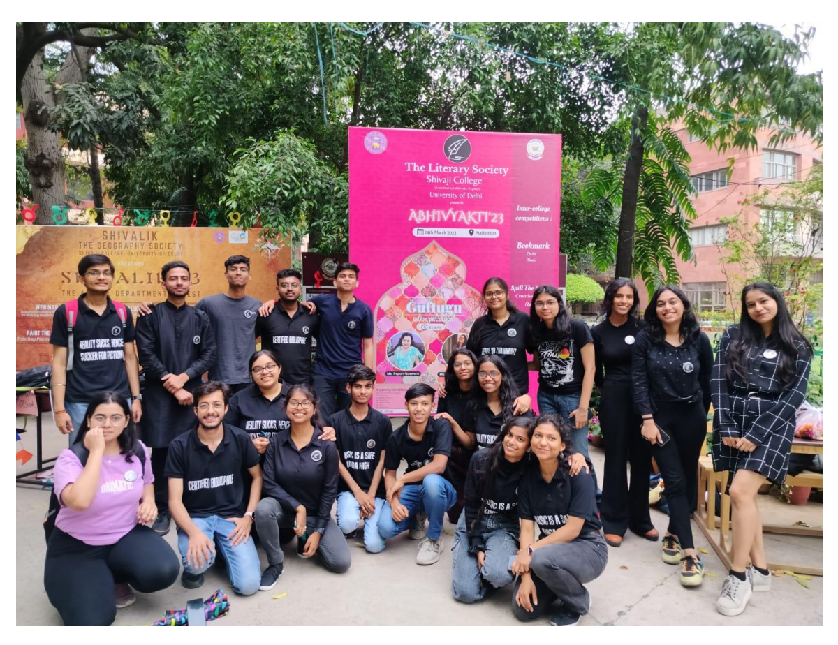
Student organisers of Abhivyakti '23