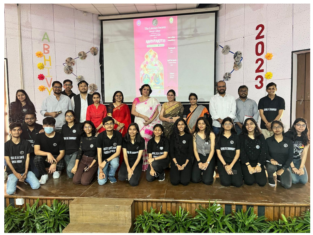
Group Photo with the invited speakers

The Society also organized a Workshop on: Storytelling through Photography March 20, 2023.